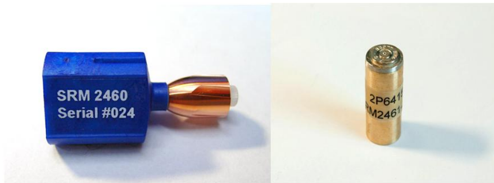
Fig. 1. A SRM 2460 Standard Bullet (left) and a SRM 2461 Standard Cartridge Case (right).

quantitative representation of image similarities; however, both the definitions and algorithms for the correlation scores were proprietary without an objective open test. Moreover, ballistics examiners needed a standard object for testing of different correlation systems for quality assurance, especially when these systems were integrated into a national network.